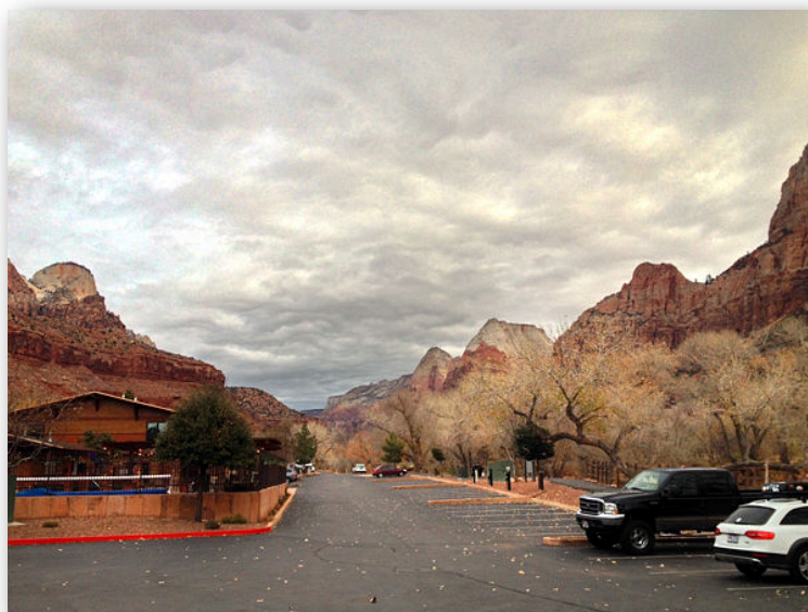
Just at sunrise in Springdale, UT. . .