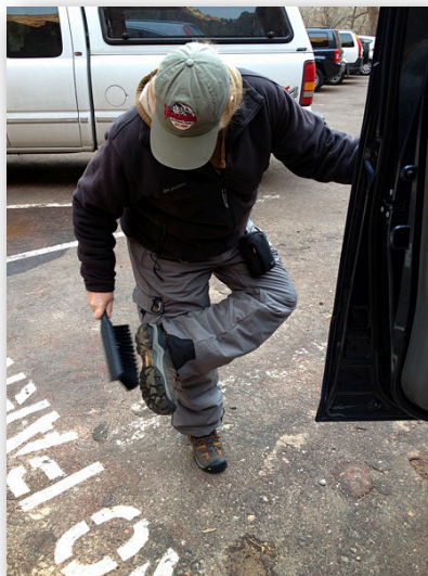
. . . the shoes also. . .