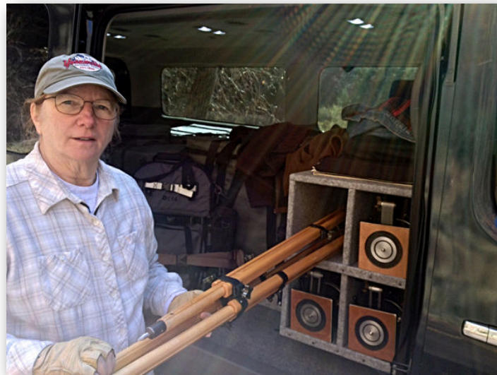
Got to get the muck off the tripod. . .