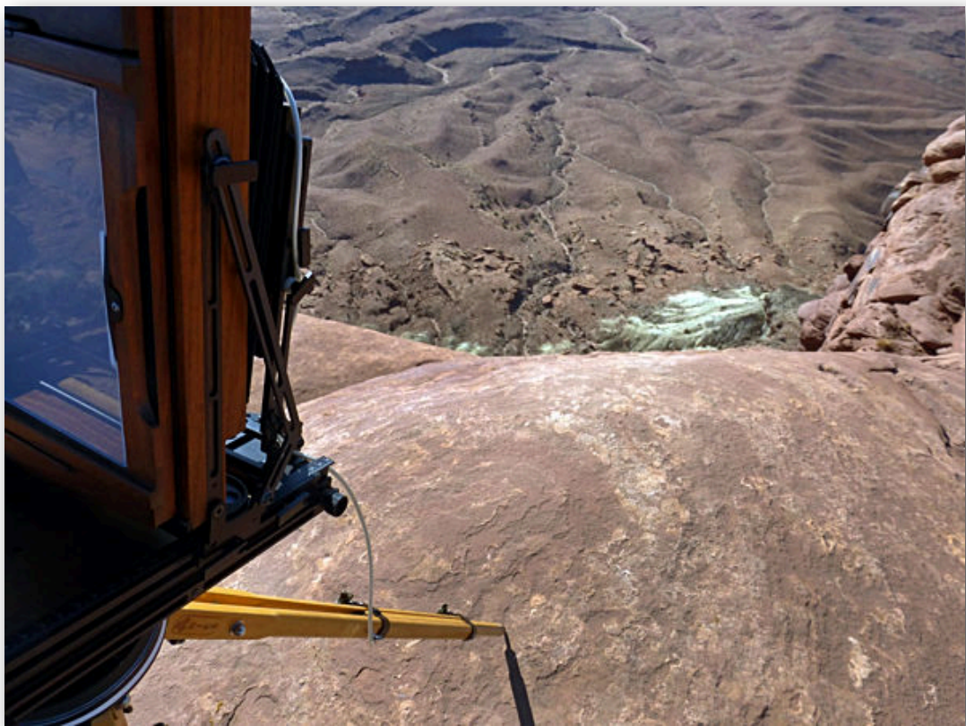
. . . and 1,200' down to the next level. . .