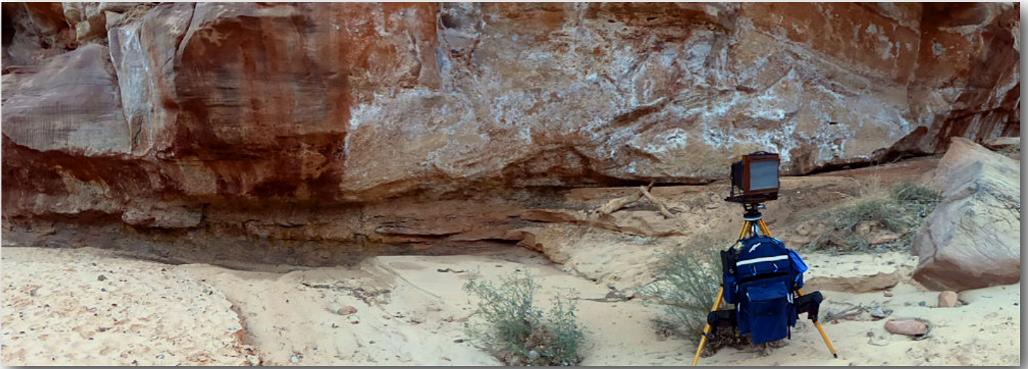
Water seeps out of this rock wall year round. . .