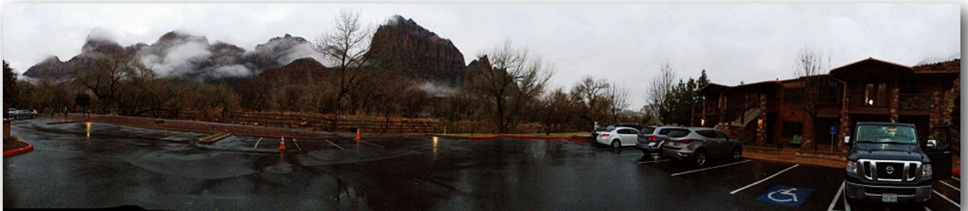
Early morning loading up in Springdale in the rain. . .