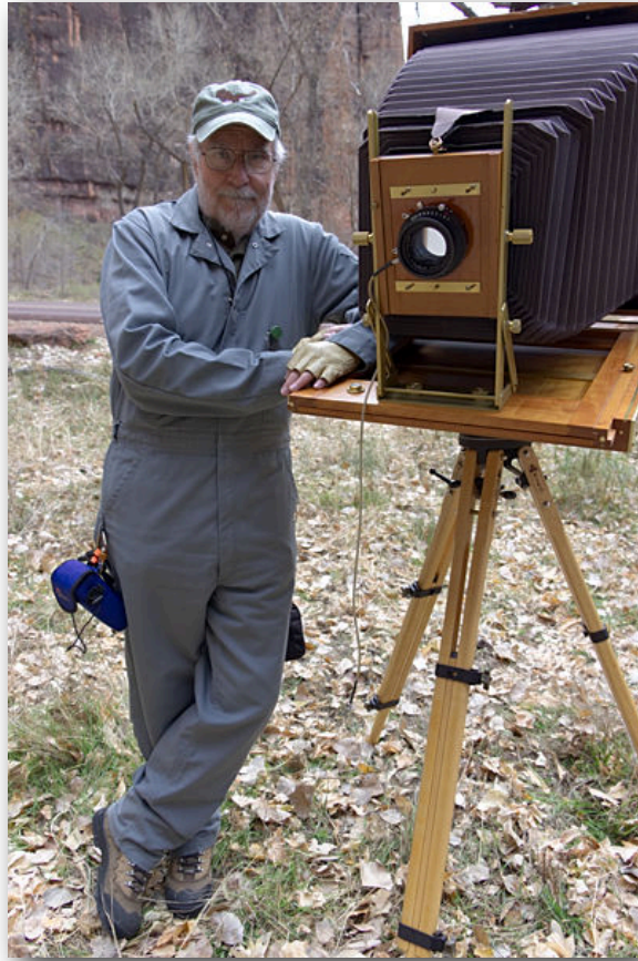
Big camera first thing while you have the stamina to get it there!