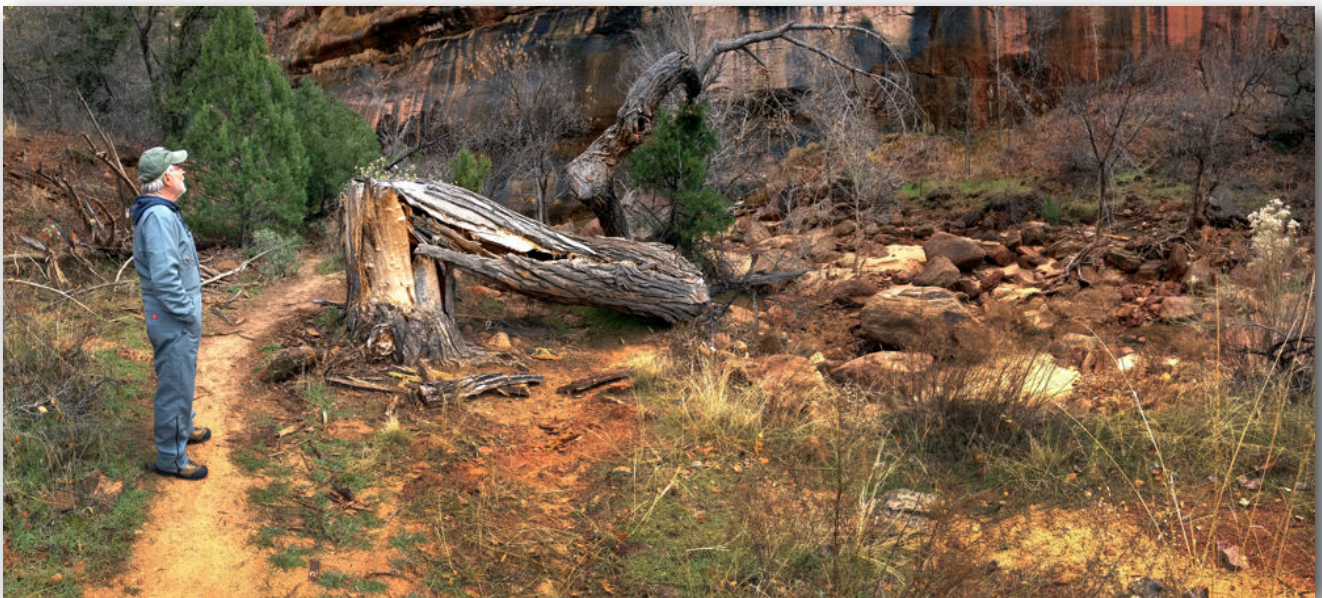
This is an amazing trail. . .