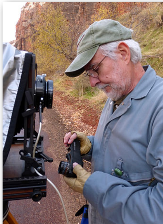
Read the meter. . . check it twice. . . thrice!