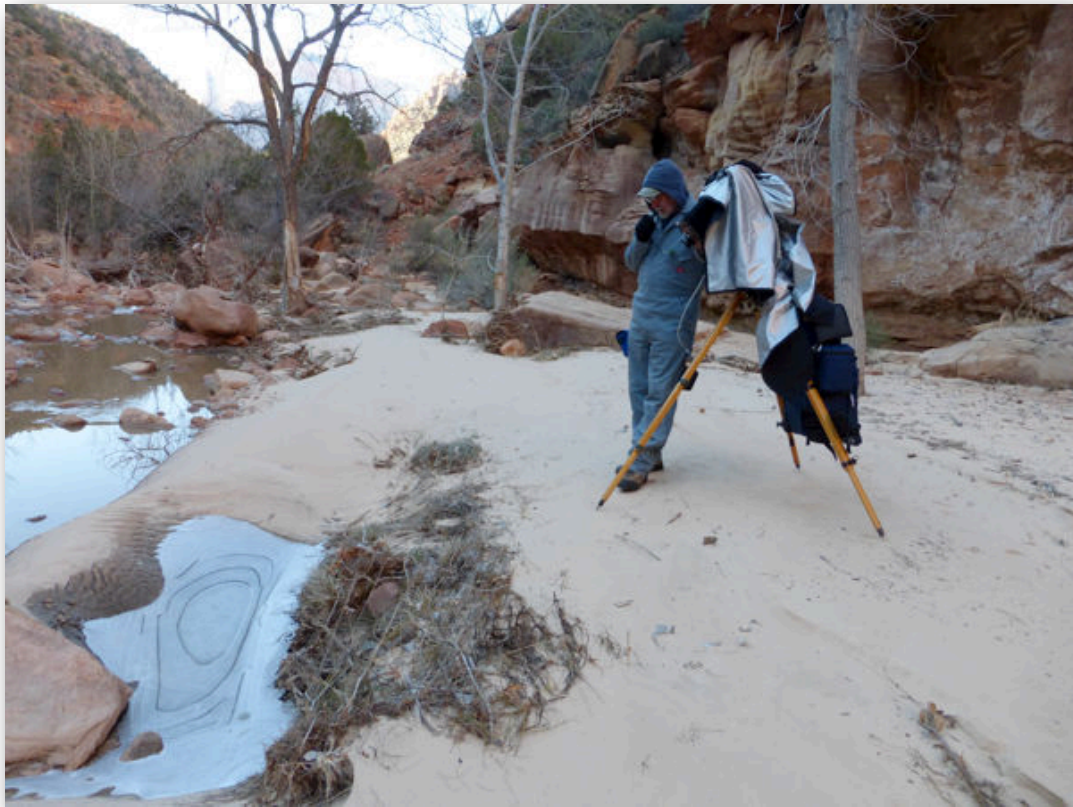
Frozen water and frozen sand along Pine Creek. . . this sandy beach was like walking on stone. . .