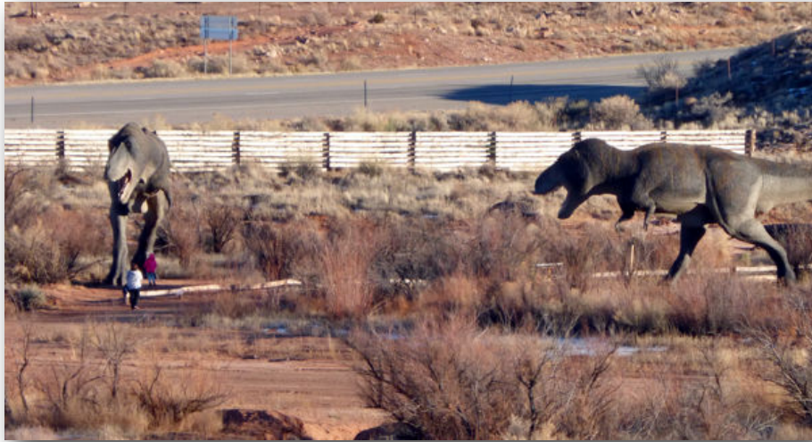
Dinosaurs chasing people. . .