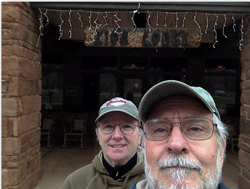
That's us. . . Zion Lodge entrance. . .