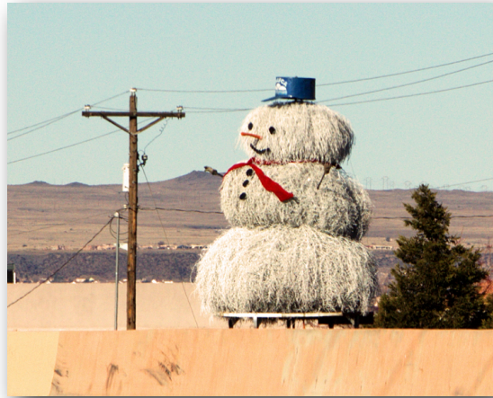
Mr. Tumbleweed Snowman is still in Albuquerque. . .