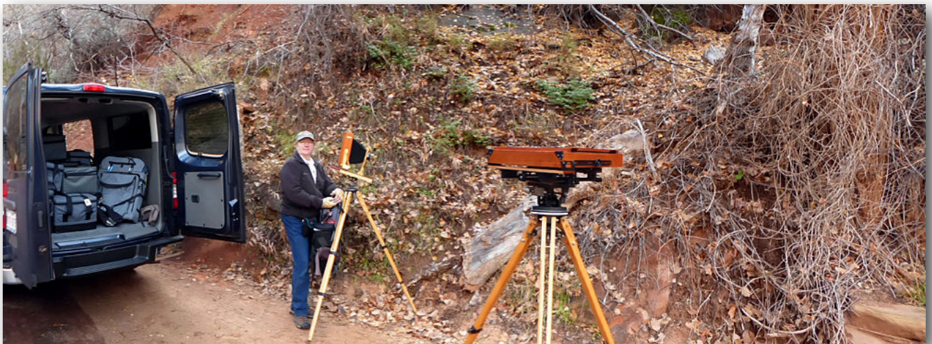
Yep, we work from the side of the road a lot!