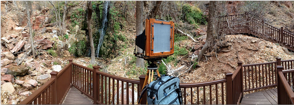
The 11x14 at Hidden Waterfall. . .