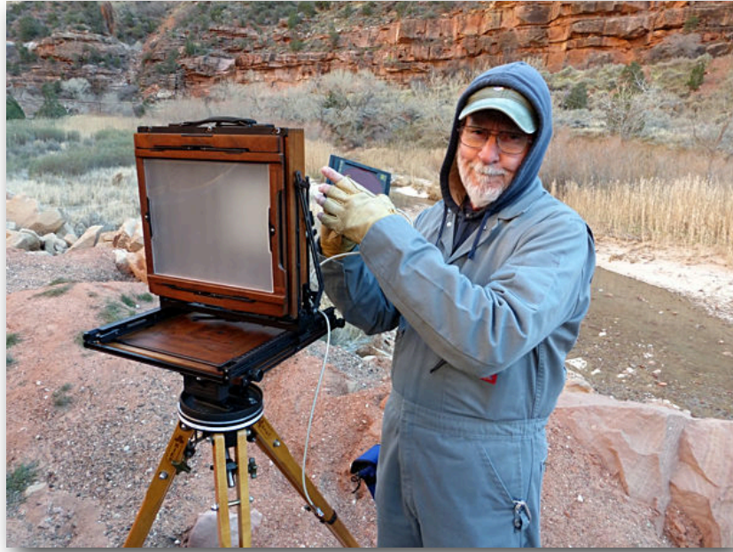
Yep. . . that is a filter. . .