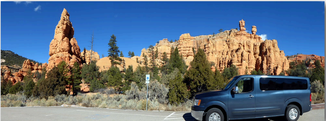
Red Canyon yesterday complete with a nasty wind. . .