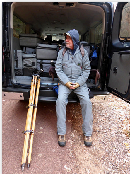
Yes, I hauled that camera all the way up there!