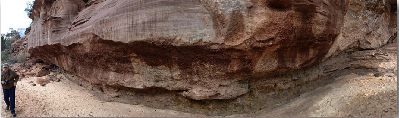
Sometimes you just hike and take in the sights!