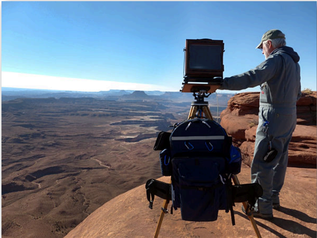
Green River Overlook, 6,000' Elevation. . .