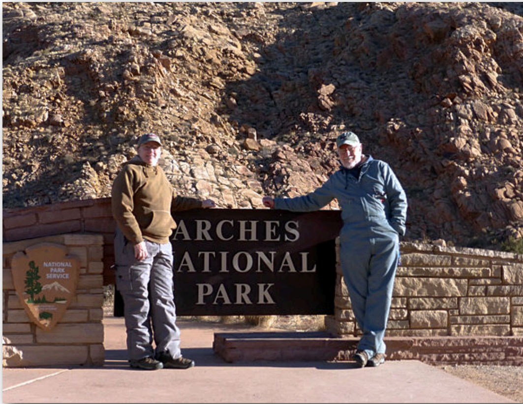
Yes. . . we made it to Arches NP. . . despite the storms!