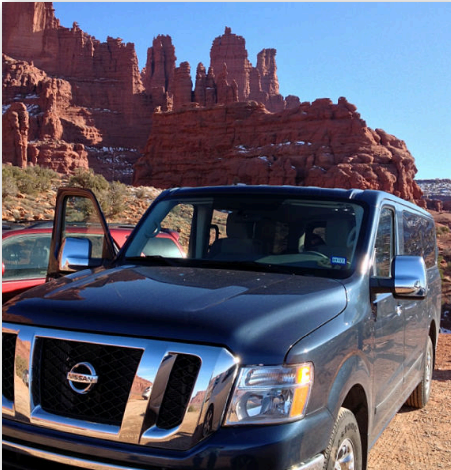
Fisher Towers. . .