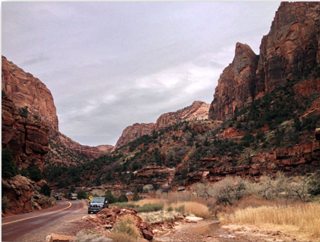
Looking into Pine Creek Canyon. . .