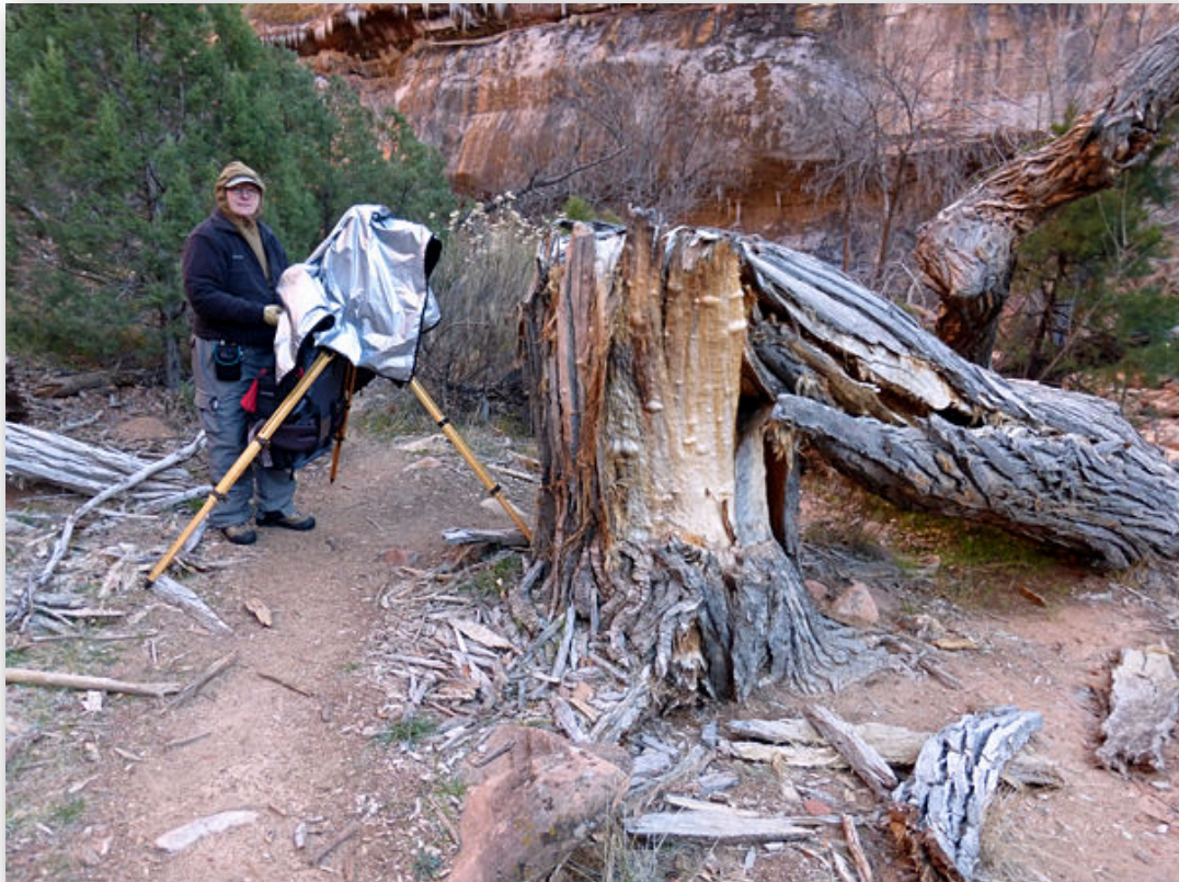
This tree has been like this for as long as we have been hiking this trail. . .