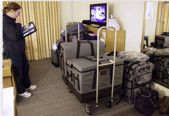
Typical hotel room. . .