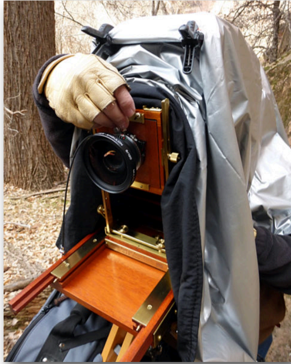
You have to operate the camera by feel. . .