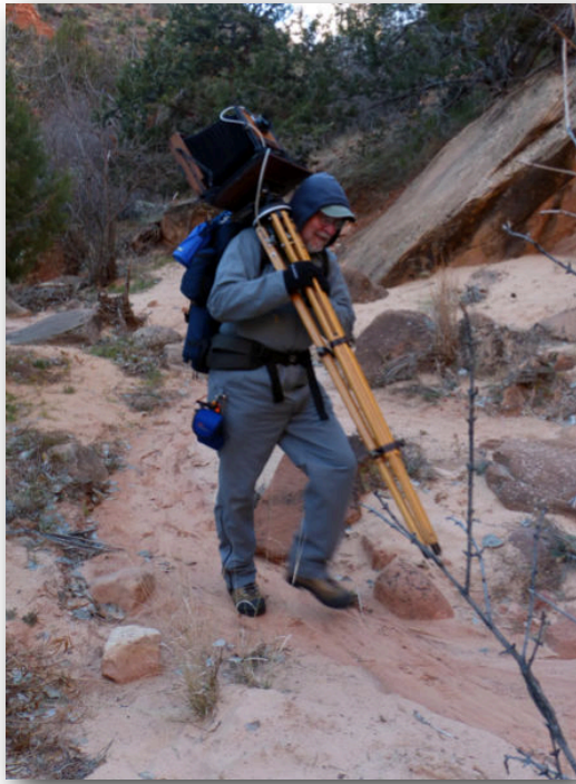
Hiking into the canyon. . .