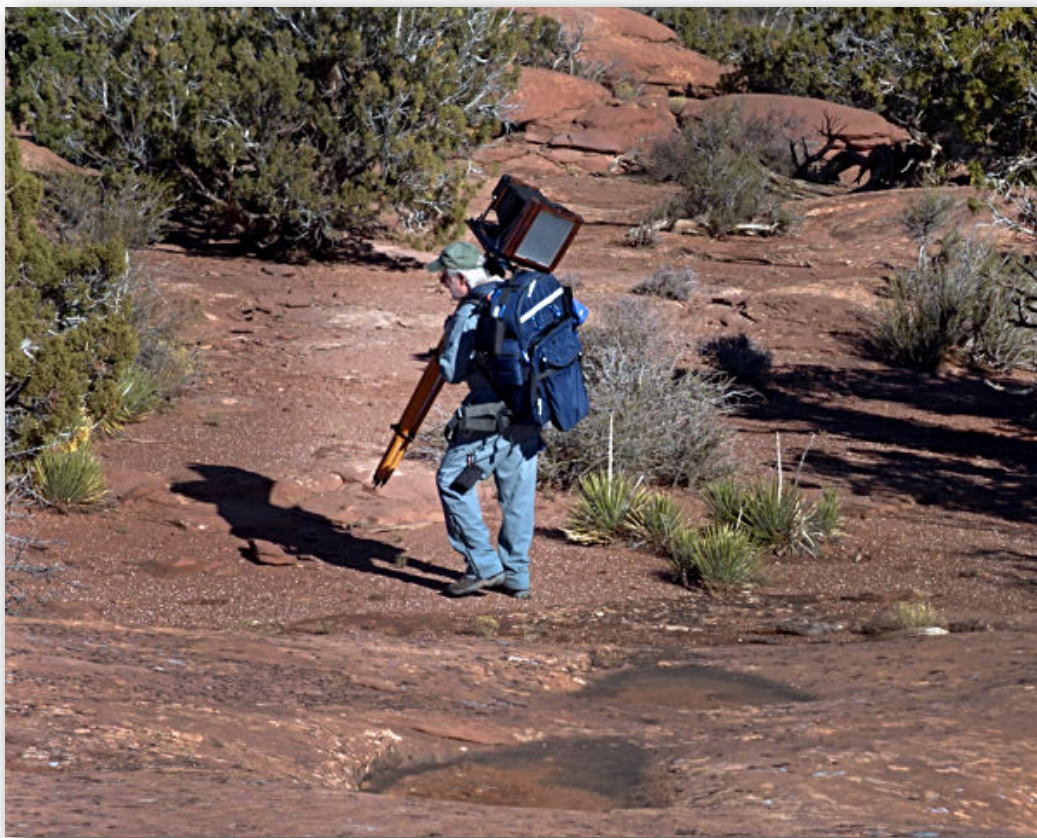
Yes, you have to carry that gear out there!