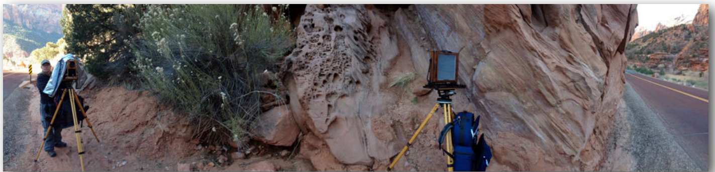
Along the road. . .