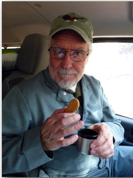
Lunch time. . . Nutterbutter and coffee. . . YES!