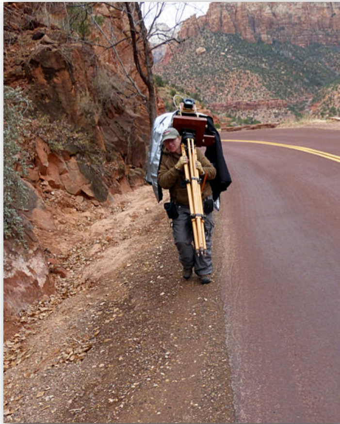
Yes, you have to haul the stuff out there. . .