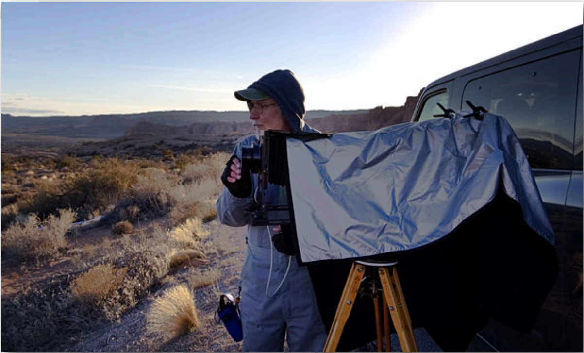
JB with 8x10 at sunset, Arches NP. . .