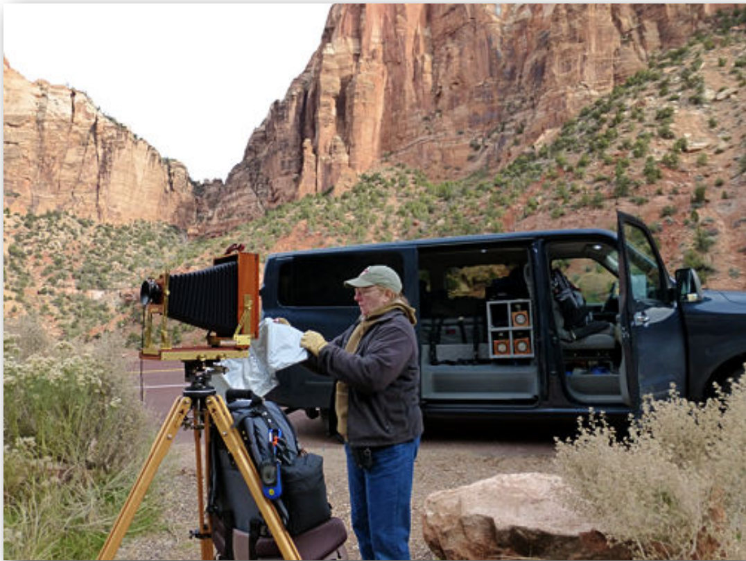
All that stuff in the truck!