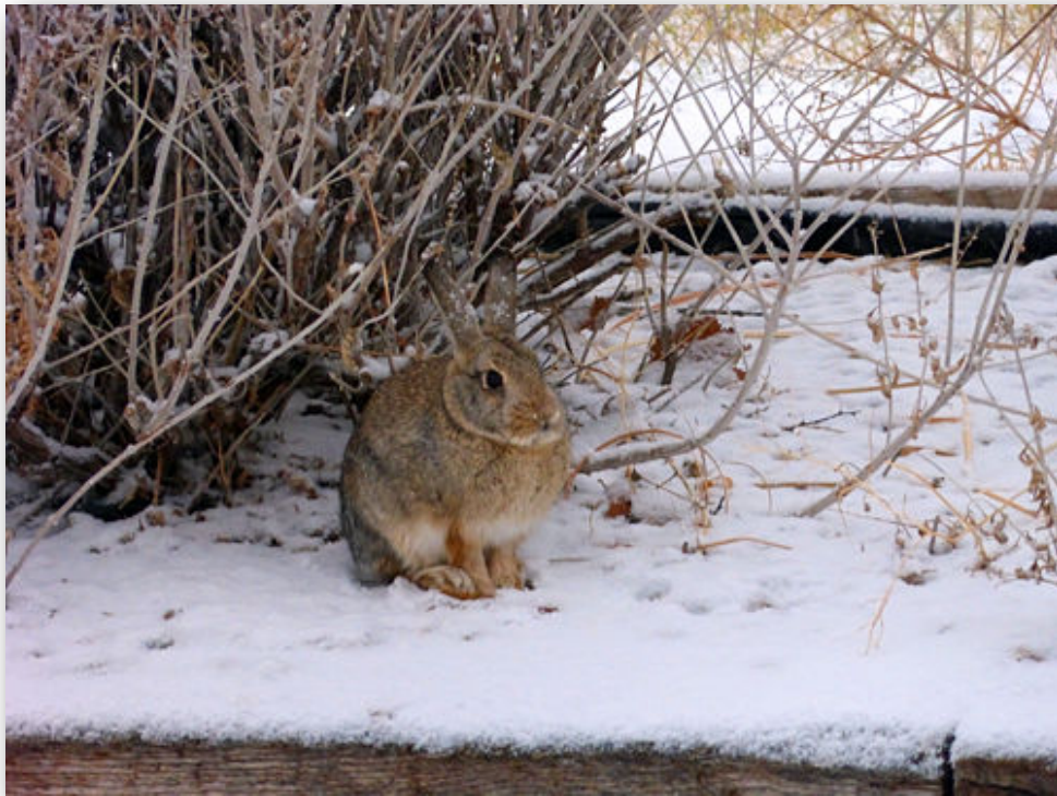
Rabbit in our back yard. . .