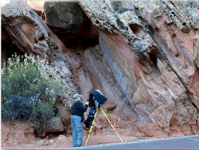
Amazing Rocks! There was a major rock fall blocking the road just beyond this point a couple of months ago. . .