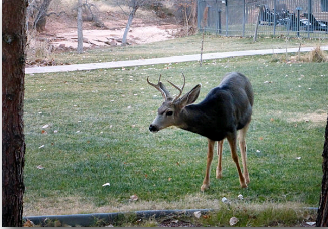
Wildlife in Springdale, Utah. . .