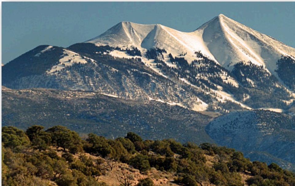
Yep, we were up there. . . somewhere???