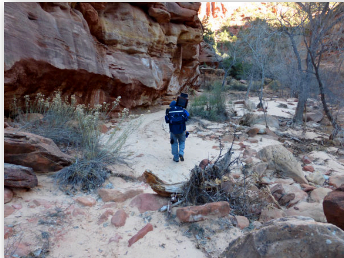
Heading to the next photo. . .