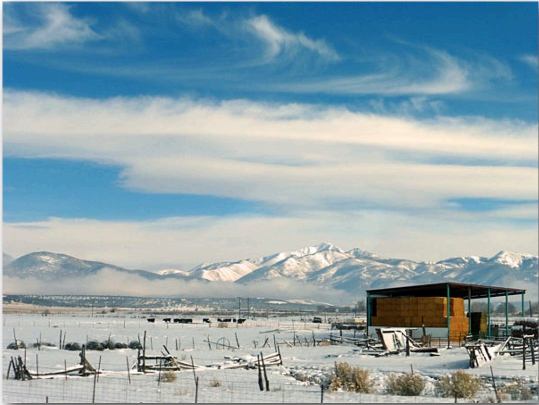
Gotta feed the cows!