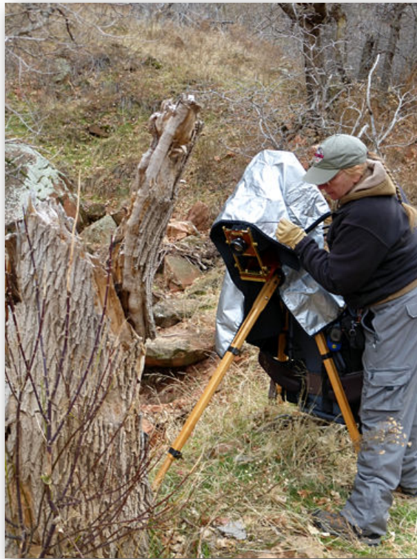
A broken, weathered stump. . .