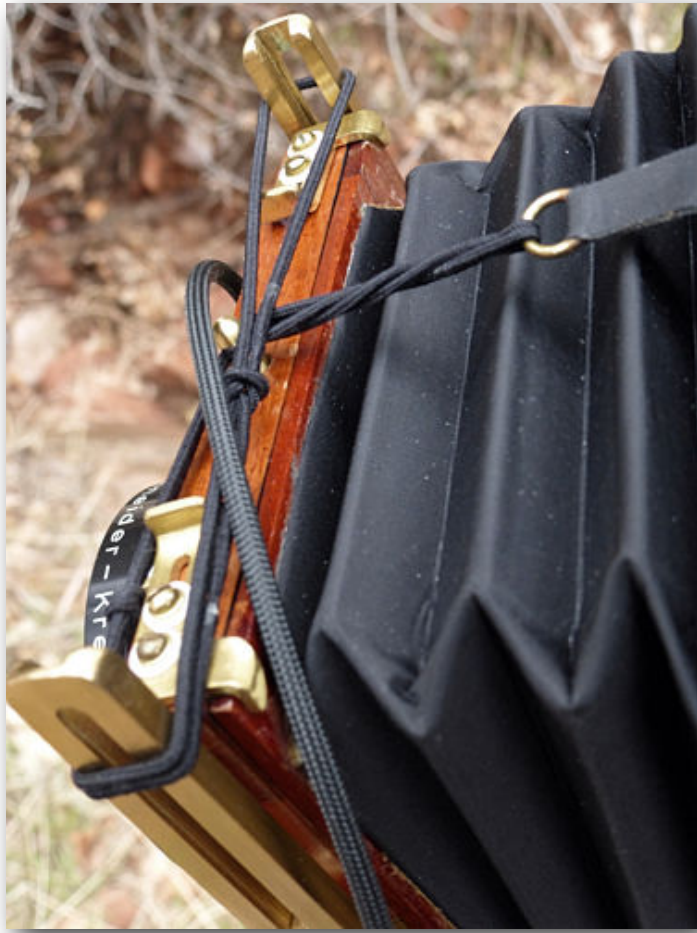
Whatever it takes. . .