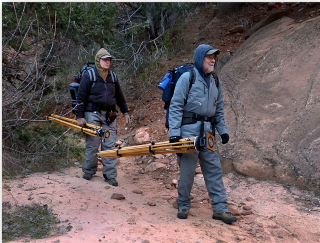
Hiking into Pine Creek Canyon. . . Yep, full packs and tripods for a day's work. . .