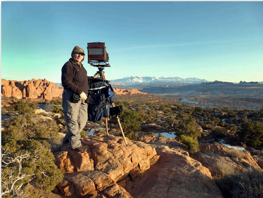
Sunset today. . . Arches NP. . .