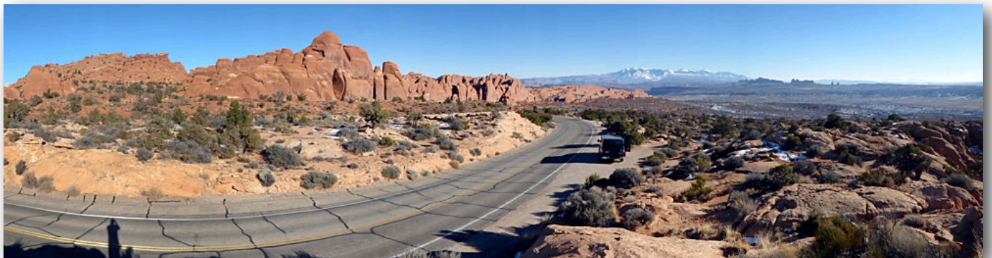
End of today in Arches NP. . .