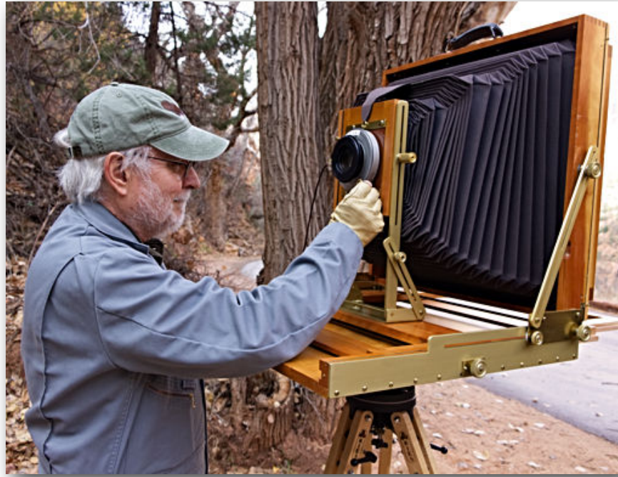
Yes, that is a 16x20!