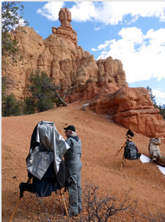
JB with even more wind yesterday. . .