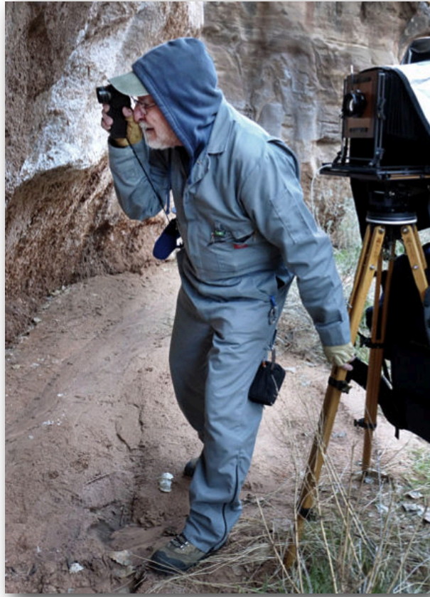
Rock wall seeping water along Pine Creek. . .