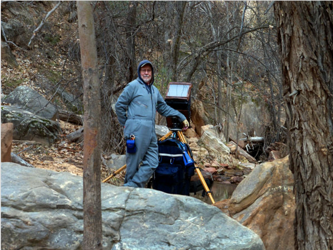
Back on the trail. . .