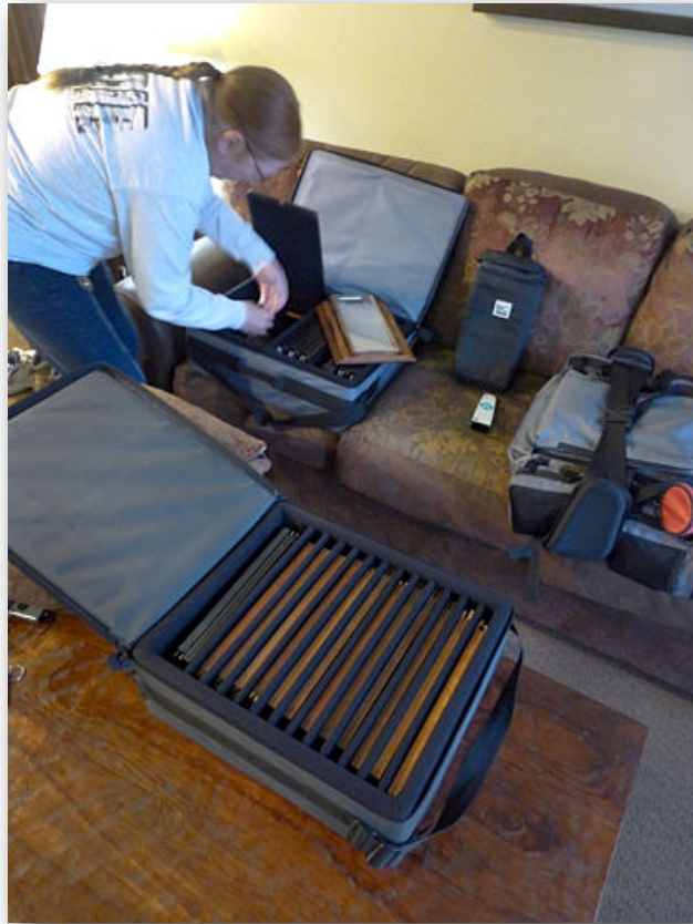
You need a lot of film holders when you travel. . .