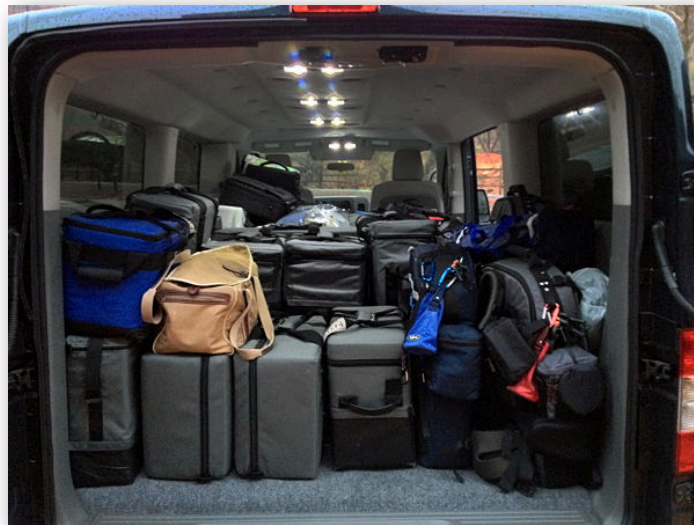
All packed and ready to roll. . .