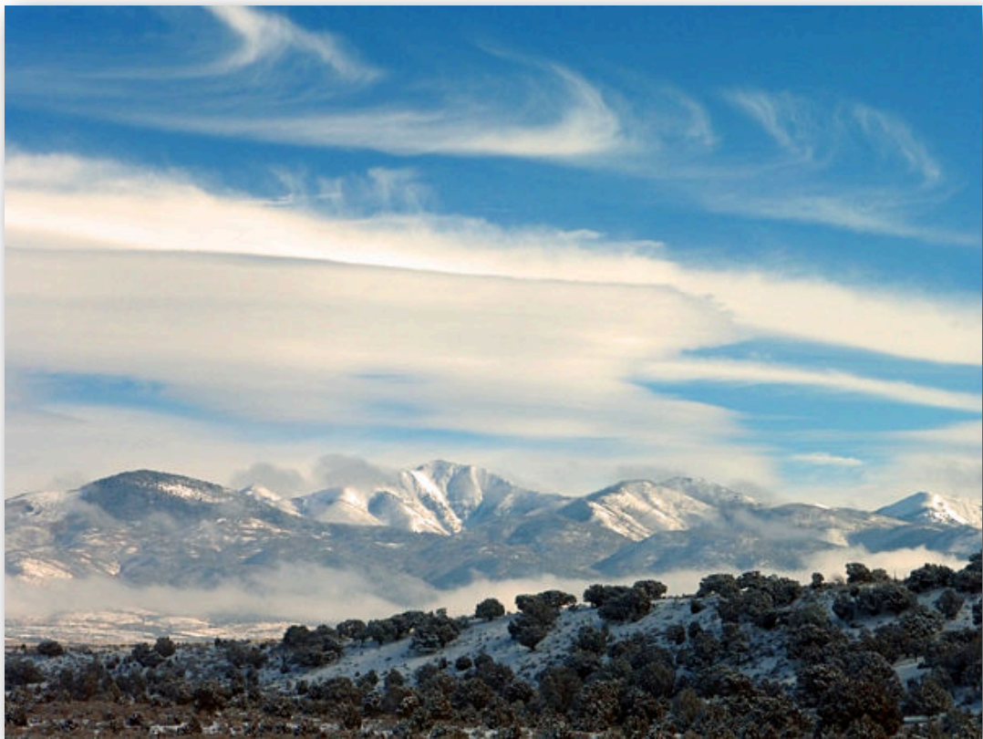
The view along the road. . .