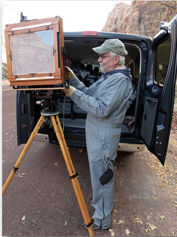
Much easier to work from the vehicle than to pack. . . That will change in a few days!