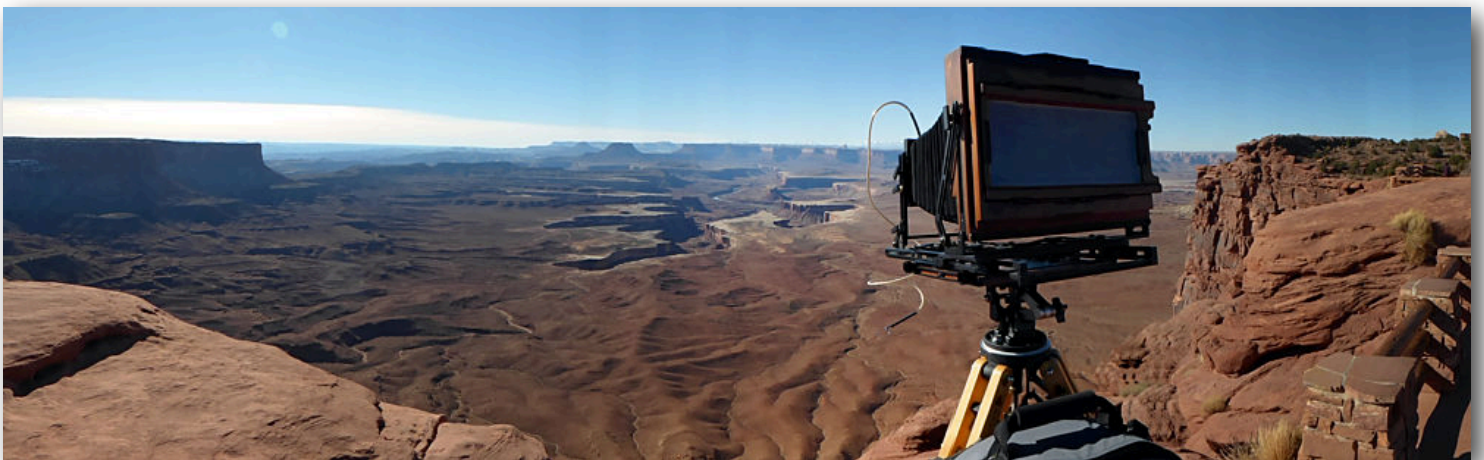
. . . the view!!!