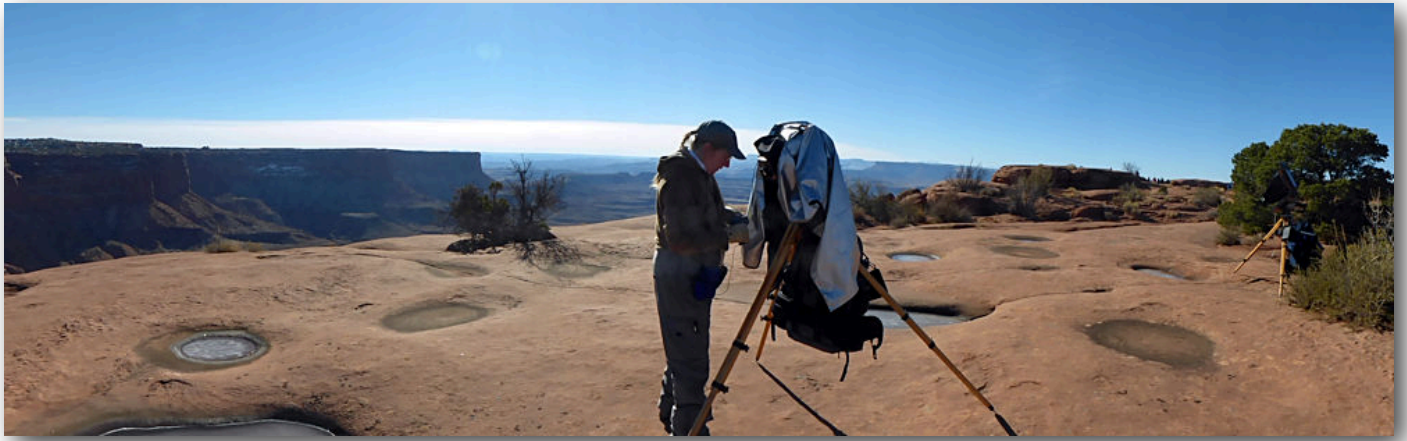
Green River Overlook. . . frozen potholes. . .