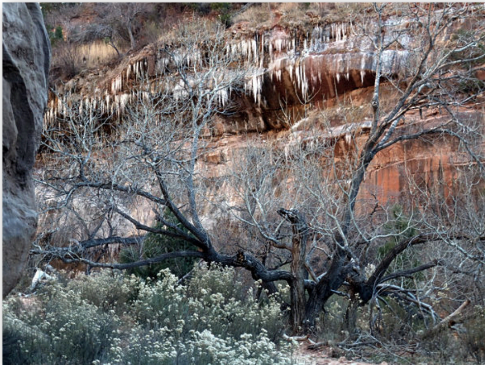
Icicles along Pine Creek. . .