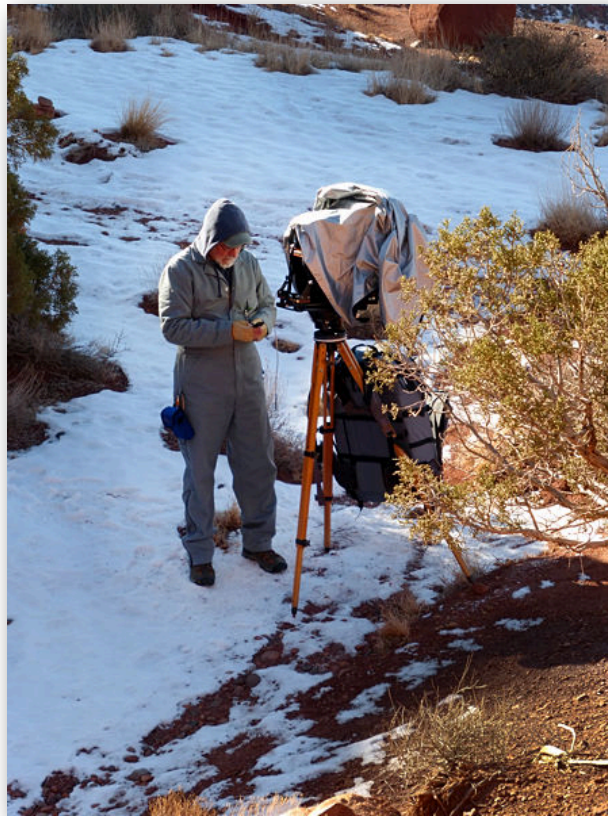
11x14 camera along Fisher Towers trail. . . a steep & taxing trail at that!