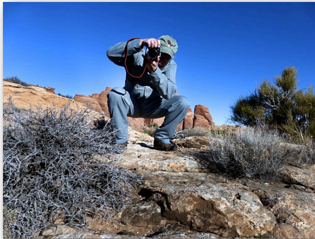
Somebody has to make those snapshots!