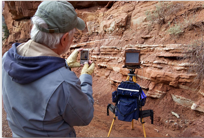
Other times you make a negative. . .