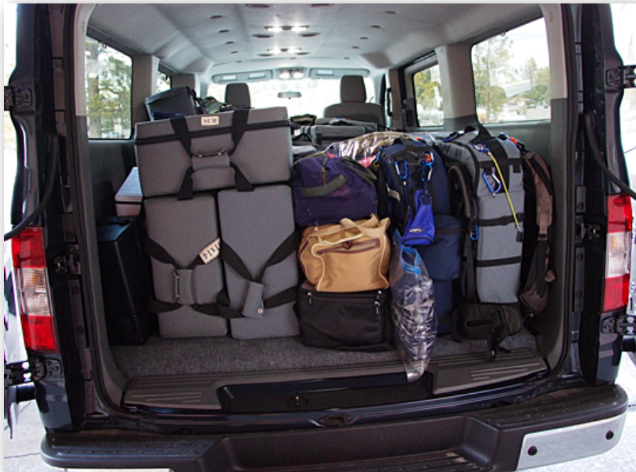
The truck looks something like this. . .