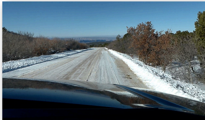
We headed into the La Sal Mountains today. . . road was a little icy. . .