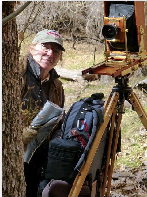
Not quite hidden. . .