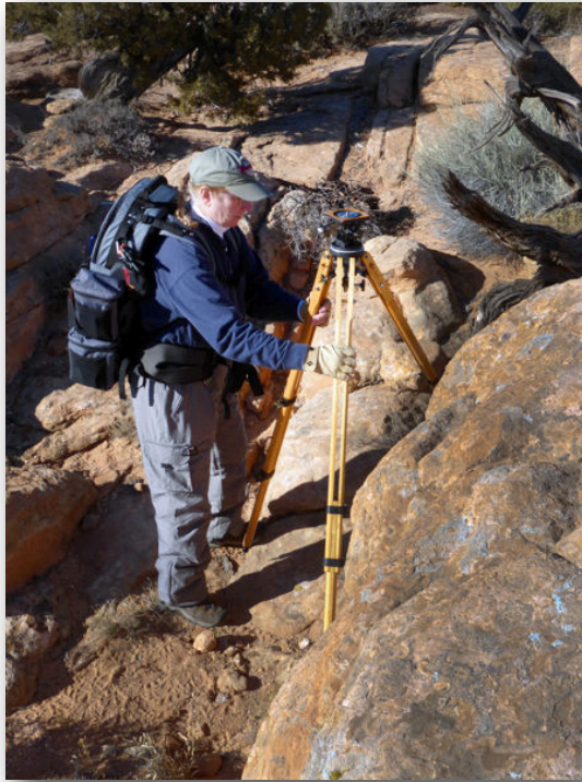
Later in Arches NP. . . You have to get that tripod in the exact place!