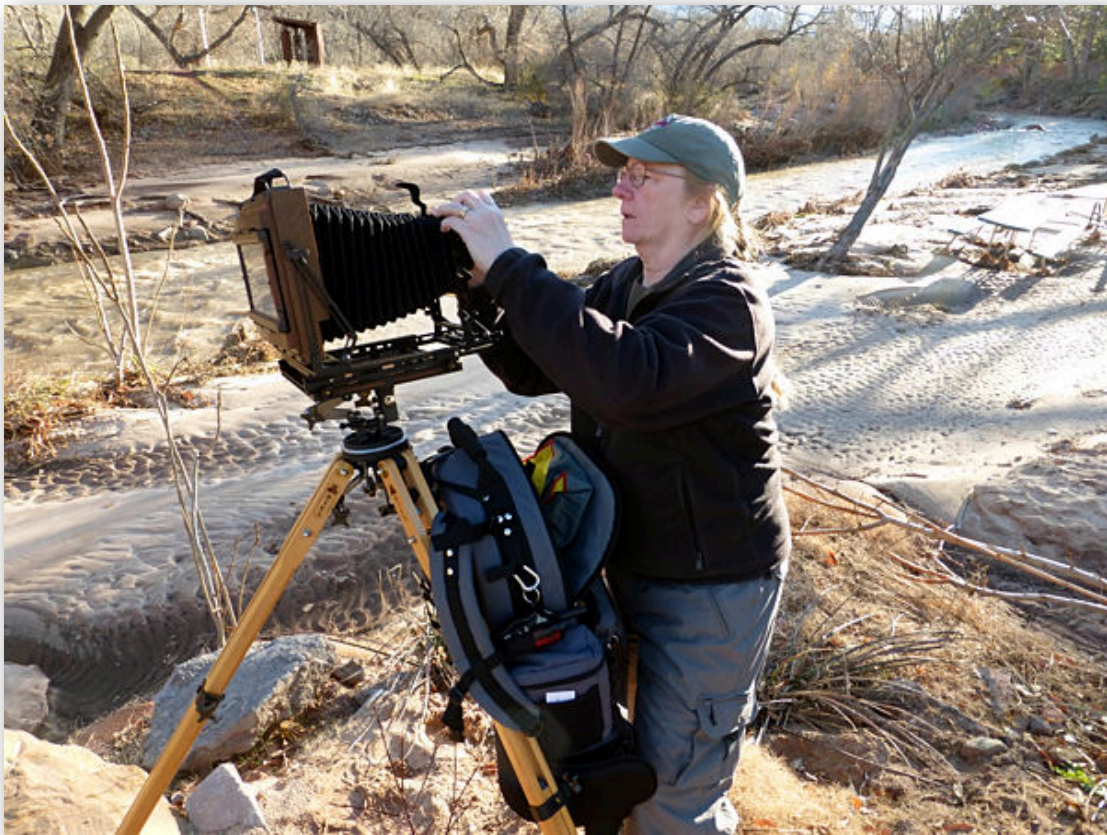
Along the river after the flood just before sunset. . .