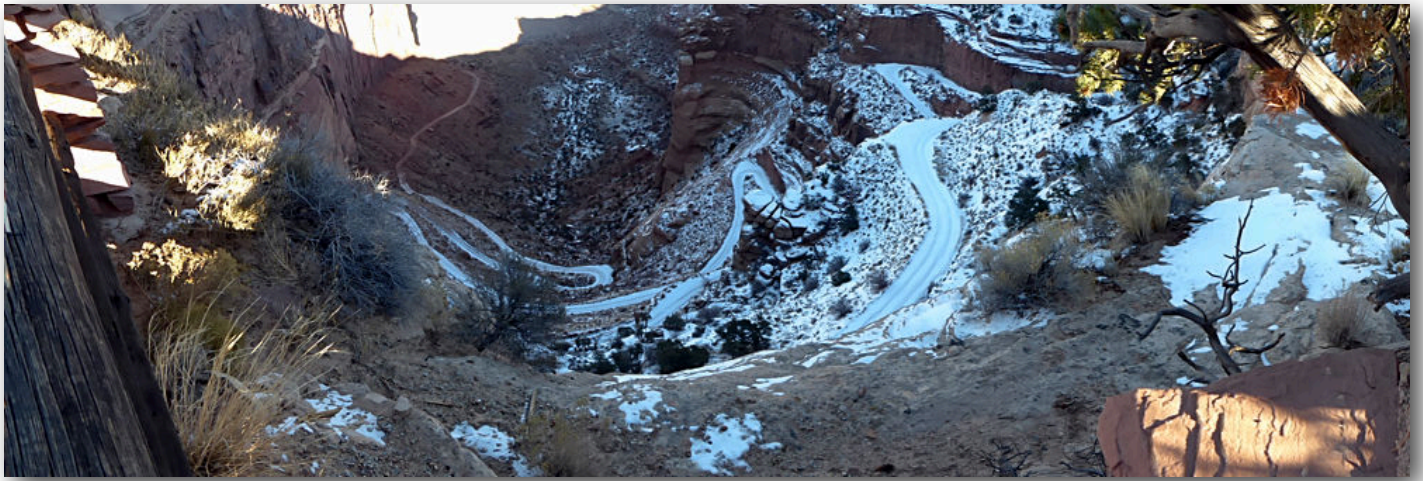
Shafer Trail is closed. . . wimps! Only a little snow! Where are those Jeepsters?