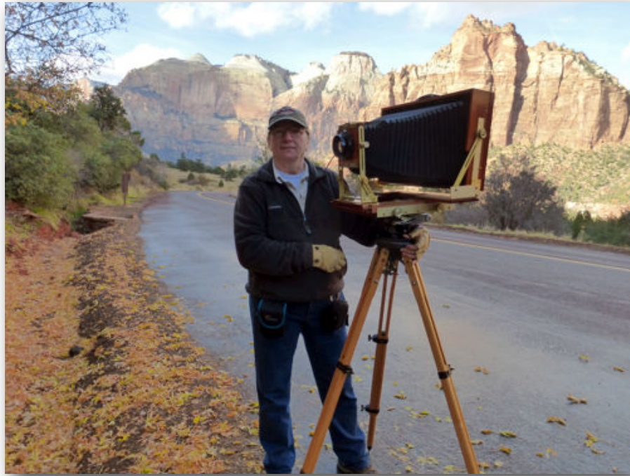
Just stay aware of the tourist traffic. . .