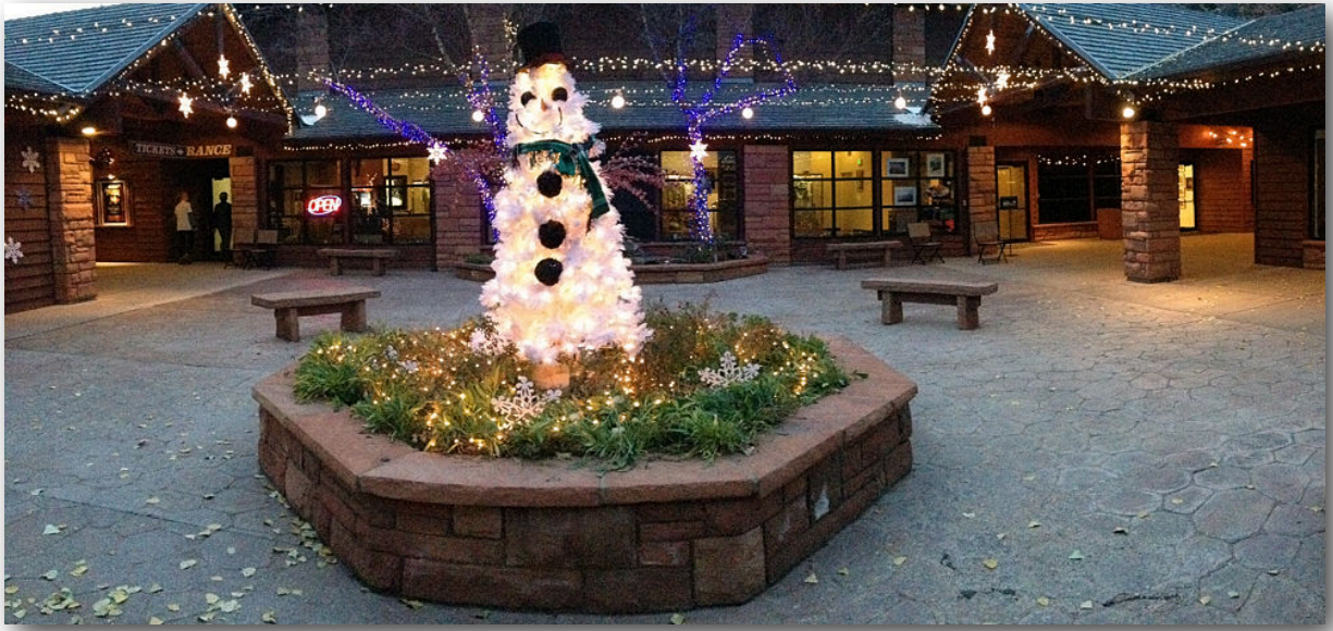
Gotta have a Snowman!