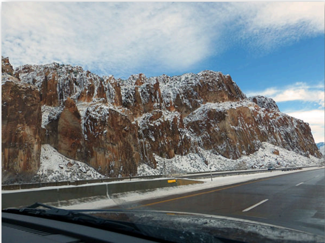
Yep. . . snow-covered rock. . .