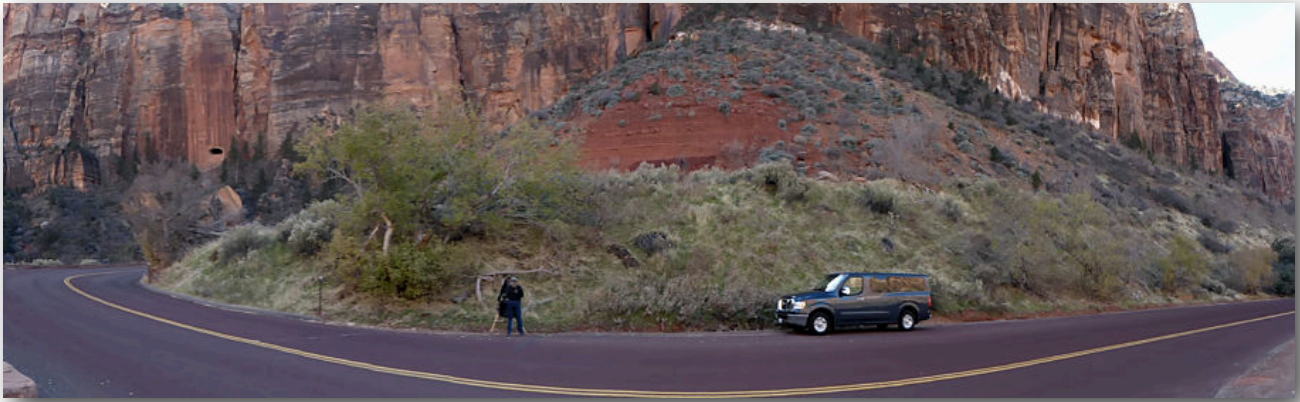
Working along the road heading toward the East Entrance to the park. . .