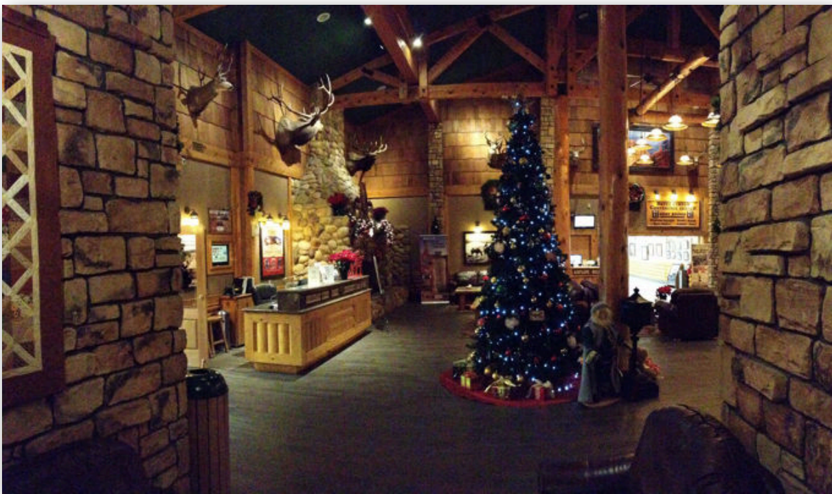
Ruby's Inn lobby. . .