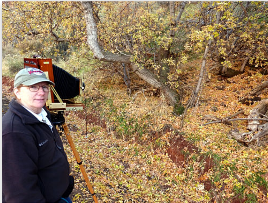
The wet leaves are amazing. . .