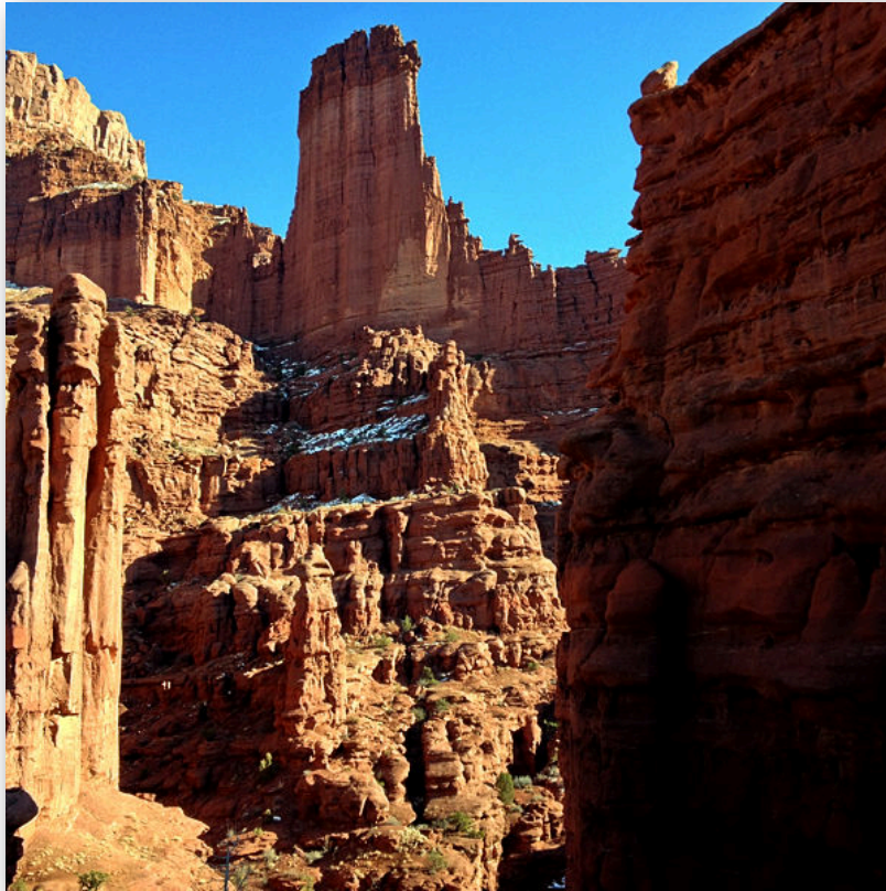
A sample of Fisher Towers. . .