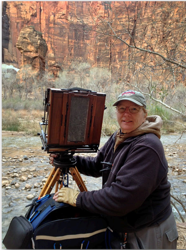
Vertical 4x10 along the river. . .