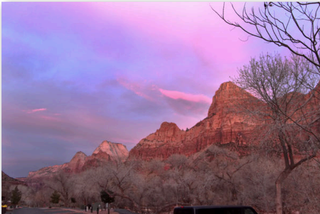
Sunset yesterday. . . a change is in the air. .