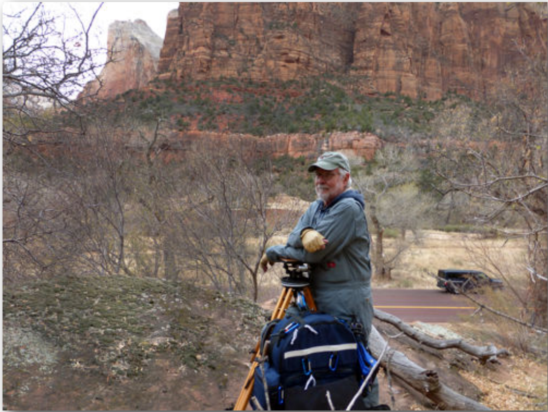
Standing on top of a really big rock. . .