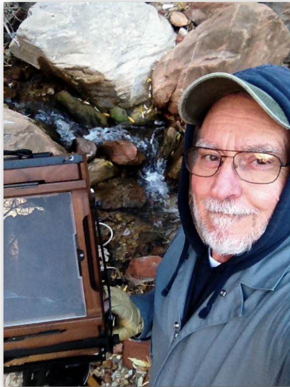
Oh Darn. . . a selfie!!!