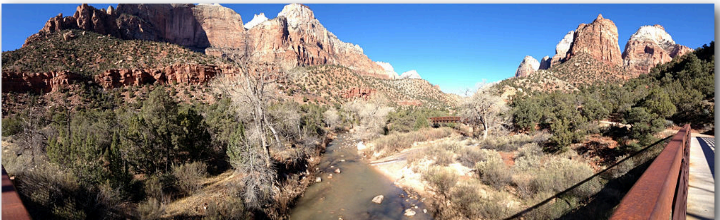
From the bridge below the Watchman this afternoon. . .