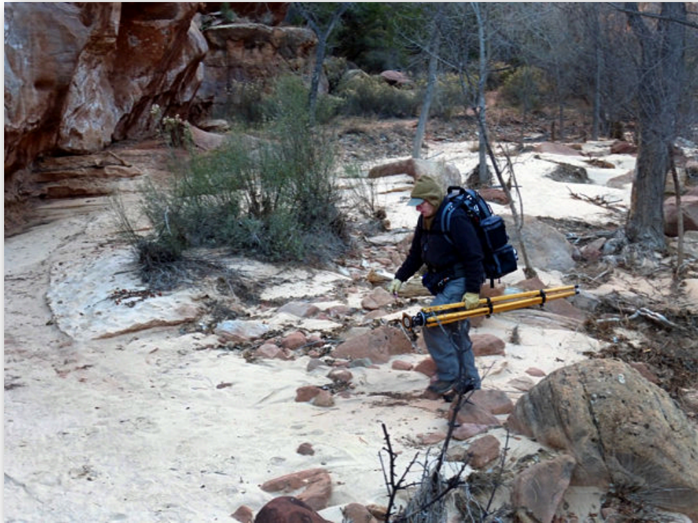
Hiking on sand beach along Pine Creek. . .