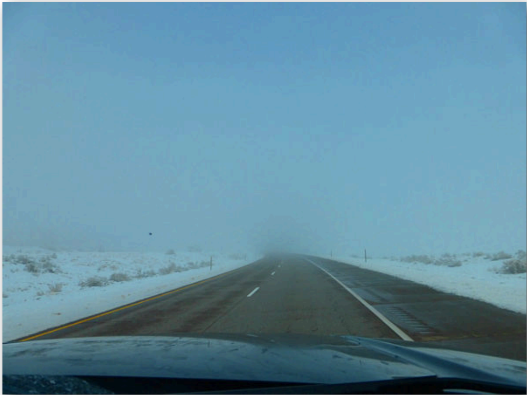
Yep. . . Fog. . . Snow. . . Freezing Fog. . . Just another day in Paradise!!!!