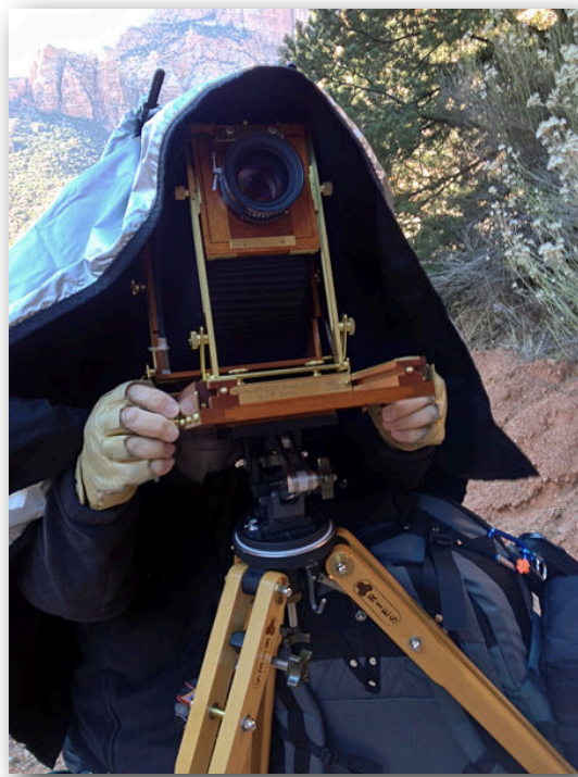
Focus. . . Focus. . .